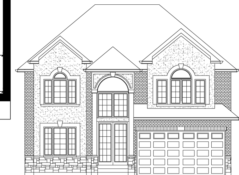
OPTIONAL ELEVATION B

Interior layout changes can be done at no extra charges.